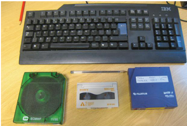
Figure 1 The different cartridges are shown: Magstar on the left, AIT in the middle and LTO-3 on the right.