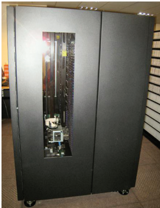
Figure 2 The IBM TS3500 ATL located in the DRS Building. The internal racking is visible and the robotic “hand” mechanism can be seen at the bottom of the cabinet. LTO tapes are also stacked on the external racking to the right of the ATL.

In 2005 ADIC informed its customers that the AML/J was coming towards end of life and would not be maintained from 2008 onwards, so in 2006 ECMWF issued an Invitation to Tender (ECMWF/2006/189) for a replacement ATL and tape drives. Tenderers were free to propose any tape technology but it was deemed to be highly desirable that they also equip the ATL with some LTO drives to facilitate the migration of the LTO cartridges in the AML/J. In the event all of the tenderers bid only LTO-3 tape technology, which contrasts with the IBM TS1120 enterprise level tape drives used by the DHS with the IBM 3592 tape cassettes to store the primary data. However none of the robots that were bid could read the barcode labels on our LTO-2 tape cassettes and as a consequence it was necessary to remove all of these labels and replace them with new ones. This manual work extended over a period of several weeks and the methodical and painstaking way this was done is a credit to all of the staff involved.